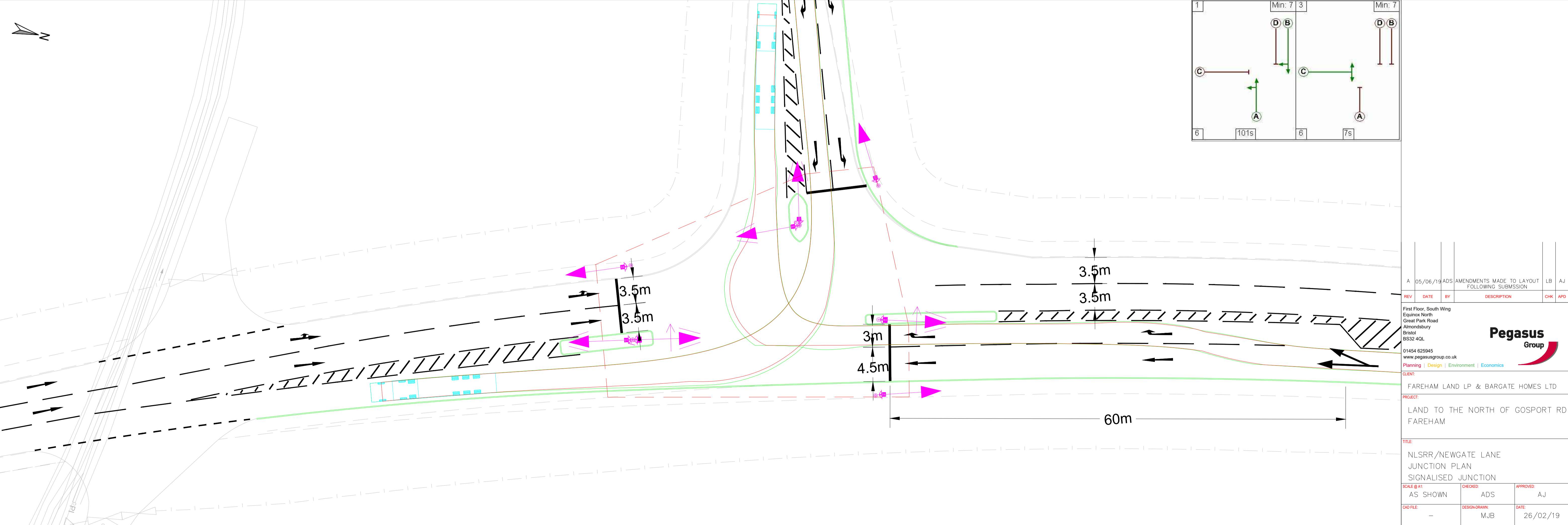
TITLE: SWEEP PATH ANALYSIS & SIGNAL PHASING SCALE: 1:250